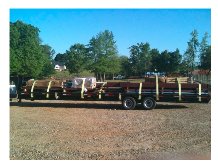
Bikes Barks & BBQ April 9th raises over $7500

Our building was delivered on Friday. Grading and foundation will be completed in the next couple of weeks. It won't be long before our wonderful rescues have their temporary home built.