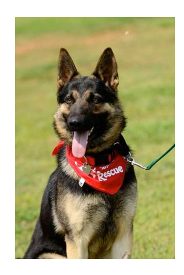
An extra special thank you to each and every CPR Volunteer... we could not do what we do without you!